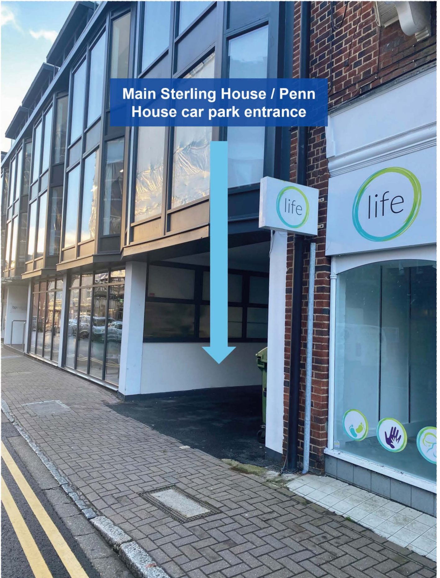
Main Sterling House / Penn House car park entrance